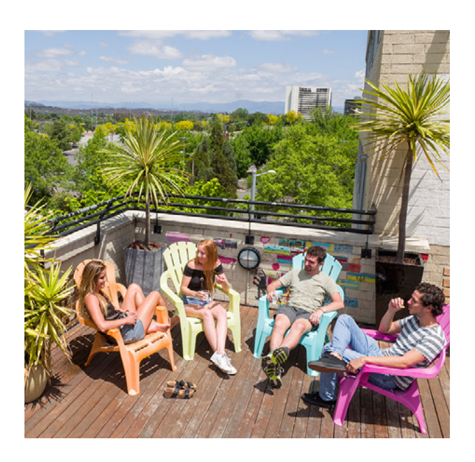
CANBERRA CITY YHA WAS RENOVATED