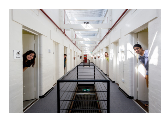
SLEEP IN A CELL AT FREMANTLE PRISON YHA!

Positive coverage in print, online, broadcast and social media