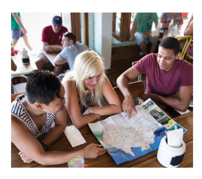
PLANNING THE NEXT TRIP

Well-attended Hostel Managers' Conference held in Hobart